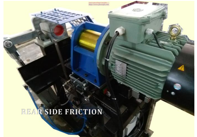
REAR SIDE FRICTION