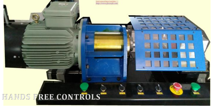
HANDS FREE CONTROLS