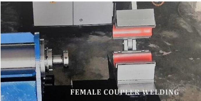
FEMALE COUPLER WELDING